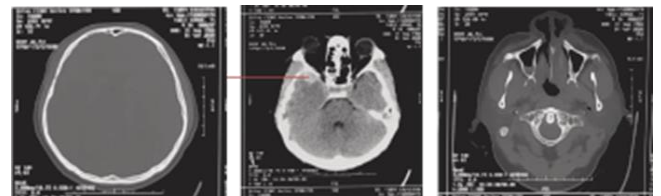
Figure 2. Head CT Scan

Laboratory finding of hematology have abnormal of Hematokrit 39.9 (Normal 41.5-50.4) and white blood count 22.80 (4.40-11.30) and other parameter is normal. Thorax x-ray, cervical x ray and pelvic x-ray showing normal radiographic picture. Head Ct Scan showing soft tissue at right temporal region, hyperdense mass biconvex at right temporal region an hematosinus at right maxillary sinus region. 3D head ct scan showing discontinuity of left orbital rim bone. USG FAST showing no sign fluid collection in hepatorenal, splenorenal, and vesical urinaria space.