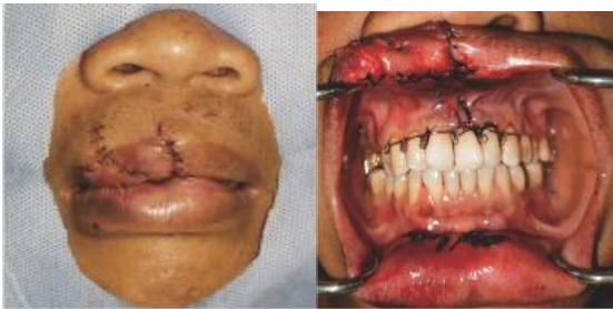
Figure 4. Post treatment after suturing intrupted ekstraoral, intraoral and Simple wiring with essig method

neurosurgery department and the patient was under observation with no specific treatment. The treatment consisted of debridement and suture of wounds, immobilization of maxillary anterior dentoalveolar fracture with interdental wiring using Essig wiring for fixation teeth 11-21.